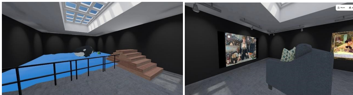
Fig. 4. Resting area and video viewing room inside the exhibition hall.

In addition, students also created a rest area by placing sofas, a swimming pool, and other amenities within the art exhibition space. They selected YouTube videos that were appropriate for the exhibition theme and created a designated space for watching the videos.