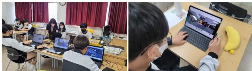
Fig. 1. The process of creating exhibition space on Mozilla Hubs using tablet PCs and laptops.