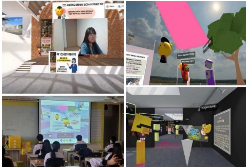
Fig. 6. Students exploring exhibition space as avatars at the opening ceremony of the Sam Museum of Art on Mozilla Hubs.