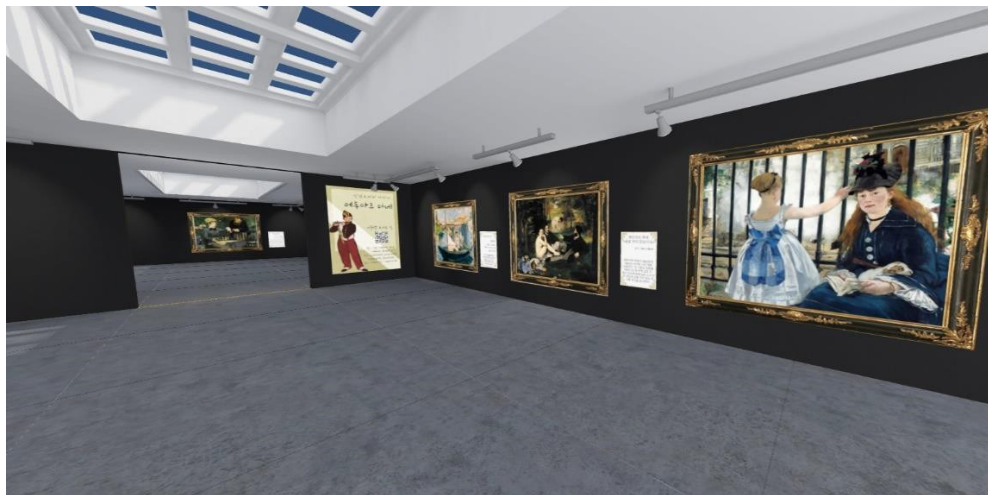
Fig. 3. The art exhibition space created by students.

At a time when social distancing measures were being implemented due to COVID-19, VR platforms were explored as a medium that could alleviate the limitations of expression and appreciation classes in art education. Using VR platform in art class, students were able to create the following exhibition space (Fig. 3). The students created exhibition spaces consisting of at least two to four spaces per group and posted appropriate exhibition works and captions on the walls of the exhibition space. During this process, students were able to naturally consider the viewer's path, the size of the artwork, and the placement of posters.