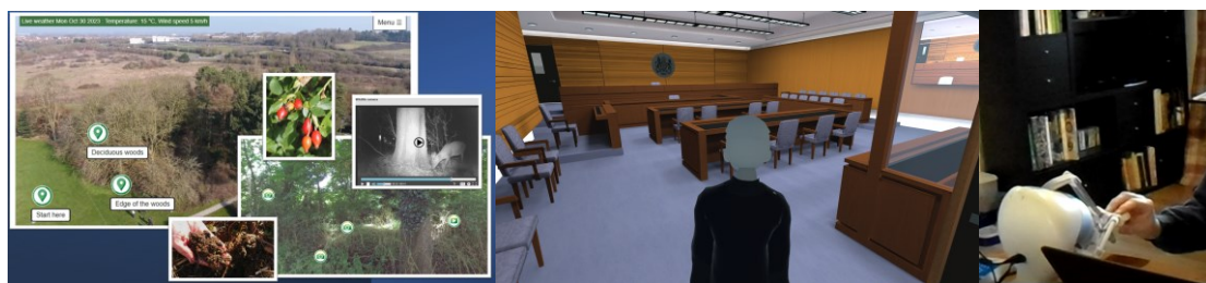
Fig. 1. 360 panorama virtual field-trip in Environmental Science (left), virtual courtroom (middle), and haptic drawing support (right).

While the first explores the use of assistive devices to support design work for people with visual impairment, the second looked at an immersive scenario. The third focuses on an accessible rich internet application with improved keyboard access (tab order, arrow key navigation, zoom) and captioning / text alternatives (alt tags on all hotspots, image descriptions, closed captions / transcripts). Issues raised by students here were to do with the lack of navigational feedback (e.g. read out the angles as you turn or direction you face) and bandwidth requirements.